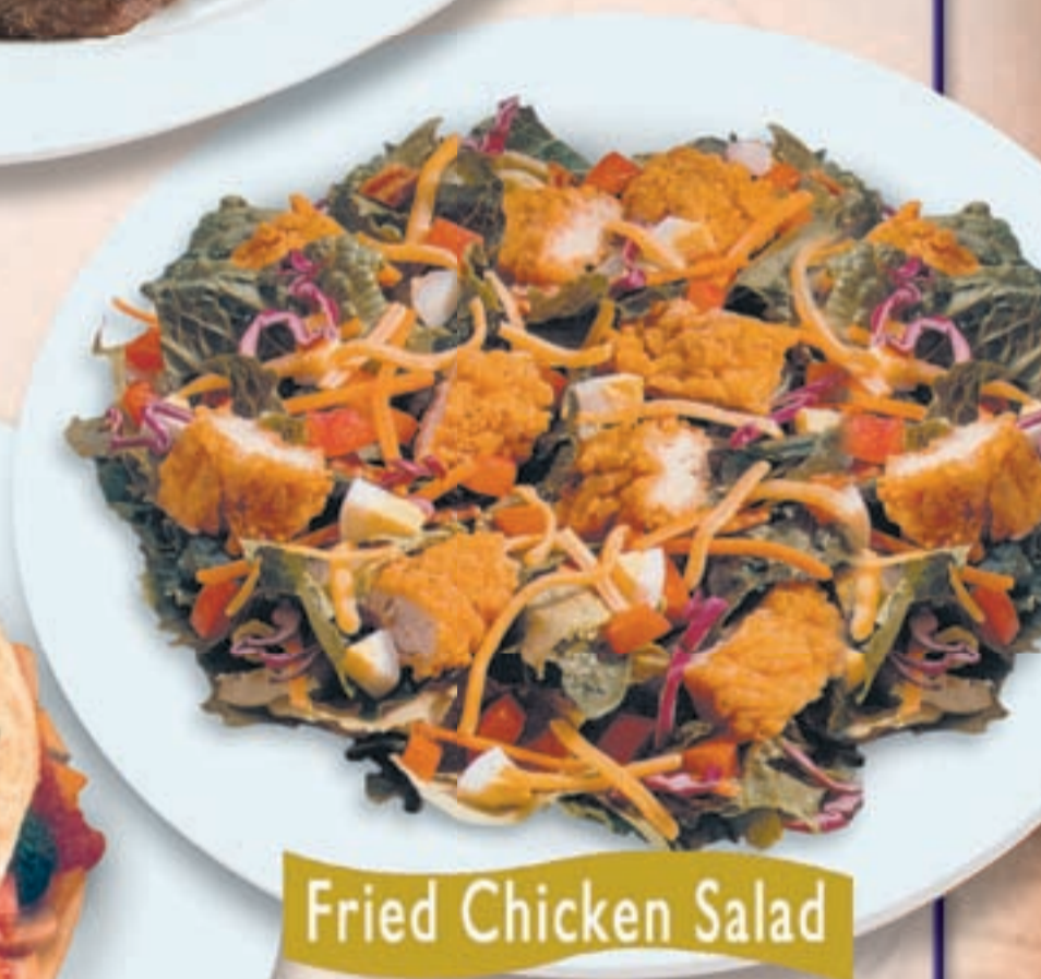
Fried Chicken Salad